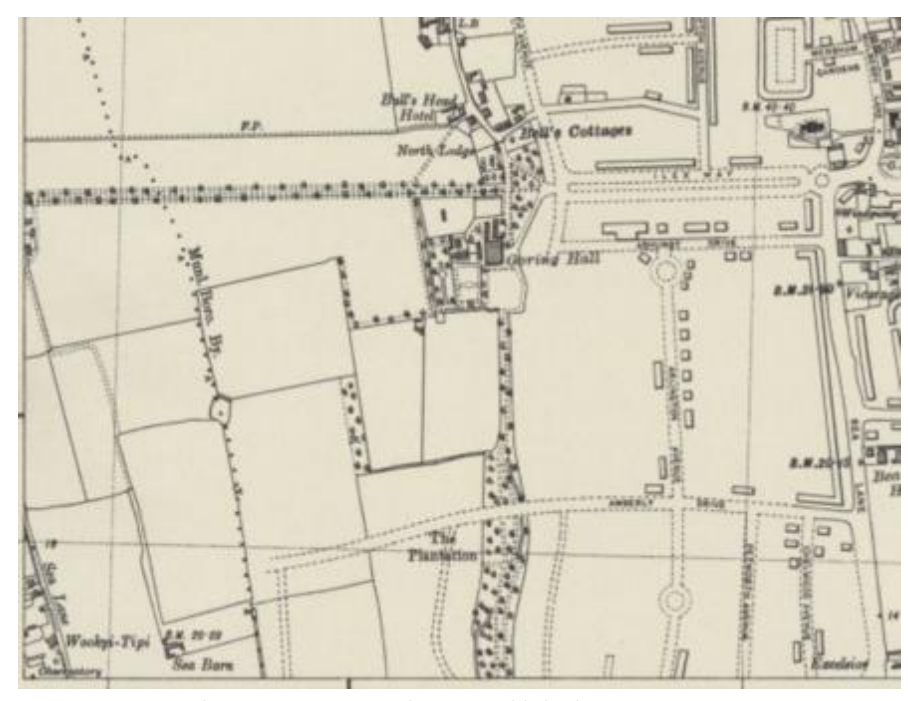
Figure 10: Sussex Sheet LXIV.SW Revised: 1938, Published: ca. 1948