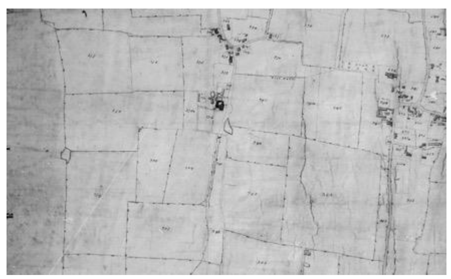
Figure 5: 1843 Tithe Map

3.20 The 1875 Ordnance Survey (OS) map shows limited change to the built form within the conservation area, but the llex Avenue on the approach to Goring Hall and The Plantation are present on a map for the first time. This map also shows the layout of the grounds at Goring Hall with the formal grounds located to the east of the house and the parkland to the north and west.