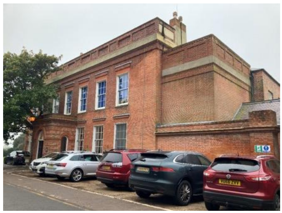
Figure 20: East facing elevation of Goring Hall with parking to front