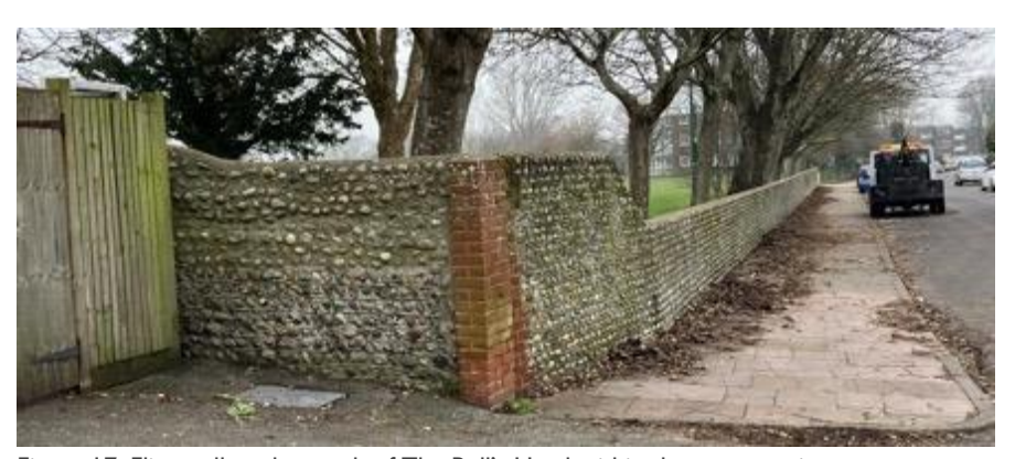
Figure 17: Flint wall to the north of The Bull's Head within the conservation area.

4.19 The Bull's Head and the flint wall to the north marks the northern extent of the conservation area. This building has entrances on Goring Street and can be accessed off Fernhurst Drive. The Bull's Head is surrounded by areas of hardstanding, in contrast to the more verdant character found elsewhere within the conservation area. To the west (rear) of the building there is a beer garden which reflects the green character of the area with mature trees and open space, but to the front of the public house the carpark provides a large area of hardstanding that detracts from its setting. A flint boundary wall runs to the north of The Bull's Head alongside the pavement of Goring Street and is another example of this type of boundary treatment that is seen throughout the local area.