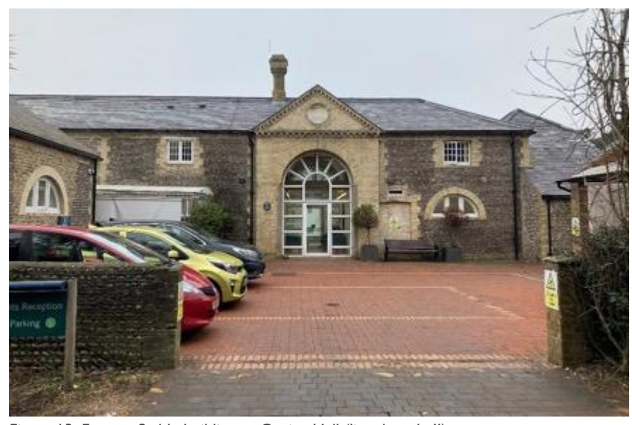
Figure 13: Former Stable building to Goring Hall (listed grade II)