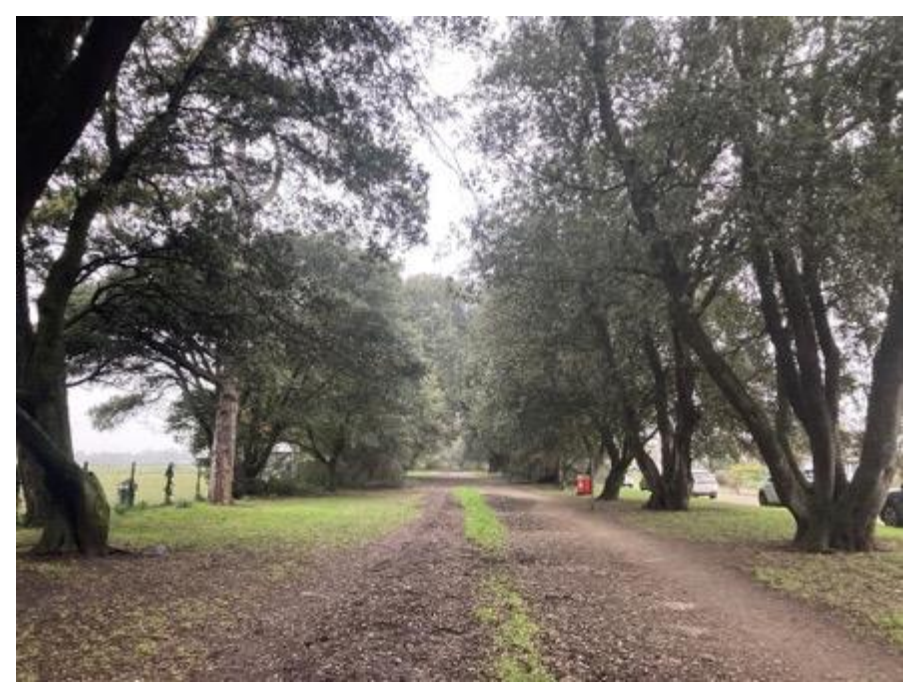
Figure 12: Ilex Avenue facing west