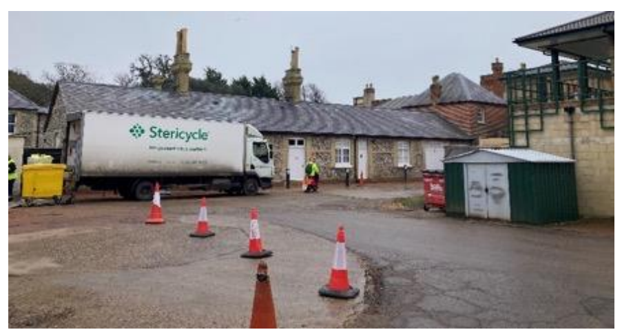
Figure 29: Extensive areas of hardstanding within the grounds of Goring Hall