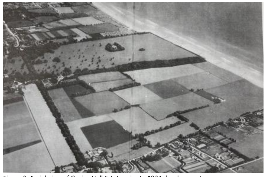
Figure 2: Aerial view of Goring Hall Estate prior to 1934 development.

the west, from the sea to Littlehampton Road as well as land that is now Maybridge, integrating the Ilex Avenue, which they identified as an important local feature. Due to the outbreak of the Second World War in 1939, only a quarter of the estate was actually built out. This stopped at The Plantation and railway line, although some roads had been laid out in the "Goring Gap" to the west of The Plantation. A gift was later made by the company of Ilex Avenue and The Plantation for public recreation.