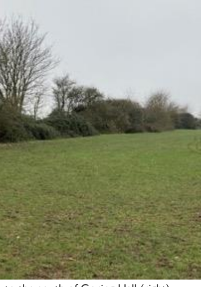
Fig 11: The Plantation (left) and the Playing Fields to the south of Goring Hall (right)