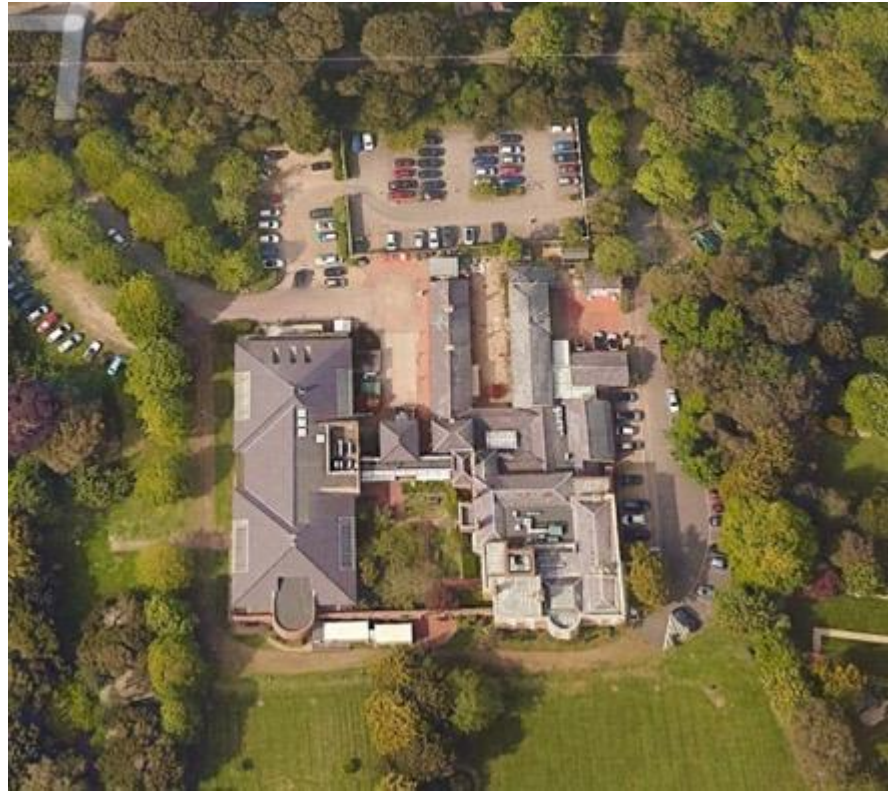
Fig 35: Google Image shows the extent of the development to Goring Hall to the west

development would be harmful to the significance of the conservation area as derived from its setting.