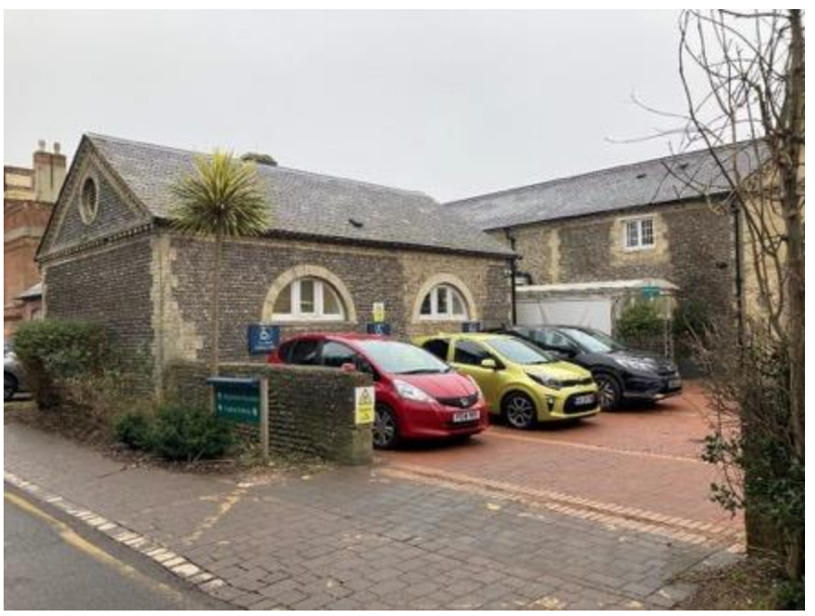
Figure 26: Examples of paving treatments in Goring Hall grounds.