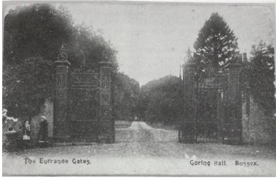
Figure 1: Eastern entrance Gates to Goring Hall Estate n.d. (pp 61)