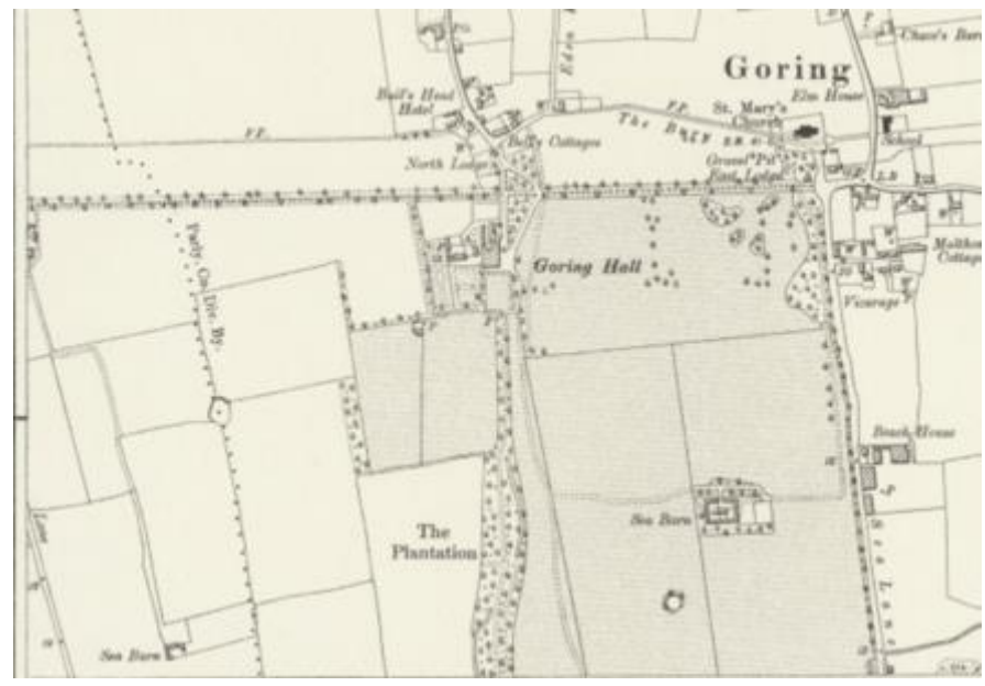
Figure 7: Sussex Sheet LXIV.SW Revised: 1896, Published: 1899

3.21 There is limited change to the built form between the 1879 and 1899 OS map. While there is some change to the footprint of Goring Hall, following the fire and rebuilding of 1888 it remains largely within the same footprint as previously.