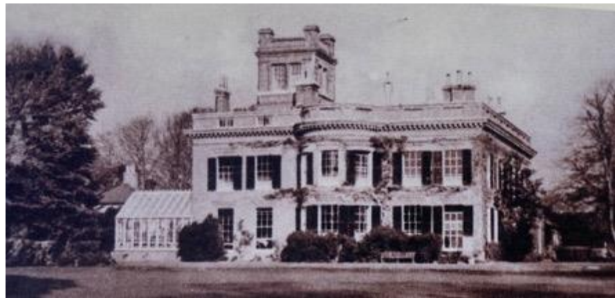
Figure 19: An early photograph of Goring Hall prior to its reconstruction in 1888

built in the Queen Anne style, in contrast to the more neo-classical appearance of the original building which was rendered. It has been altered and extended in the 20th century, but retains a sense of the original building. Although not the oldest building within the conservation area (The Bull's Head has 16th century elements behind an 18th century façade), it is the grandest. The building is set within substantial grounds and the remaining service buildings in flint and yellow brick also contribute to the architectural interest of the conservation area. The flint buildings in particular are characteristic of the vernacular tradition of the locale.