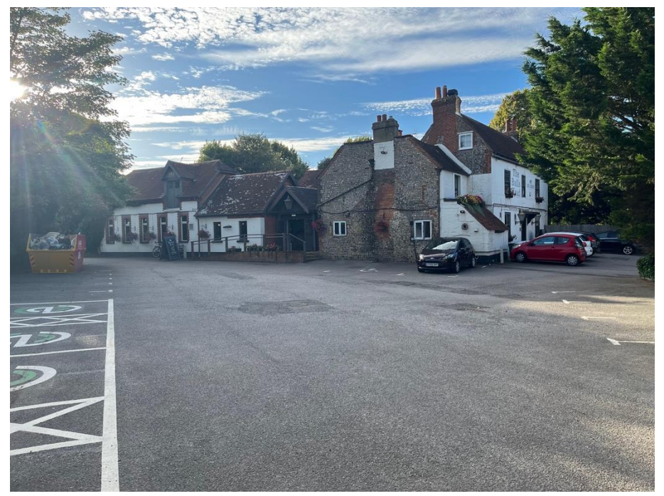
Figure 36: Hardstanding at the Bull's Head