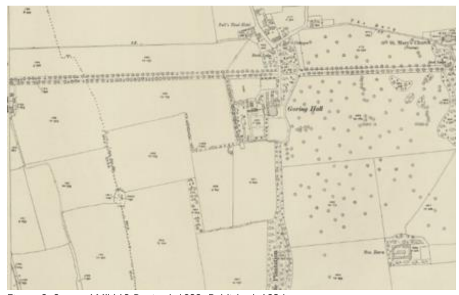
Figure 9: Sussex LXIV.13 Revised: 1932, Published: 1934