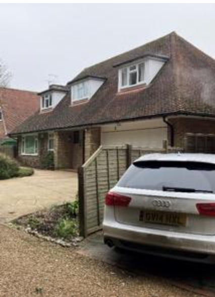
Figure 22: Historic flint outbuilding at Goring Hall (left) and modern housing to the north of Goring Hall grounds (right)