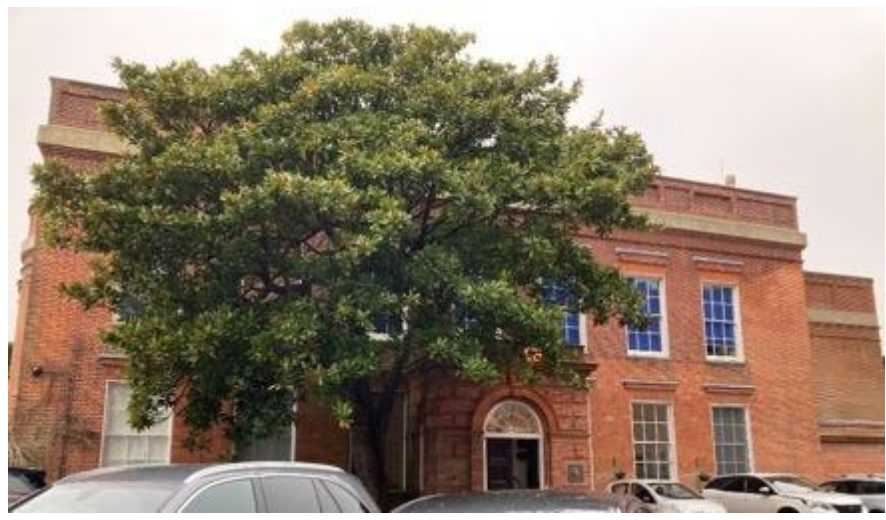
Figure 25: Brick used at Goring Hall