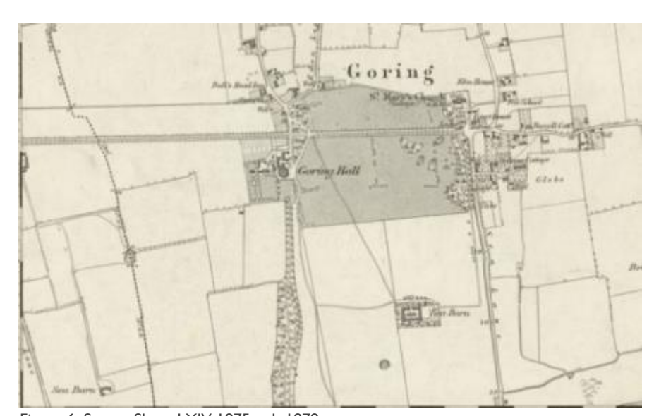
Figure 6: Sussex Sheet LXIV 1875 pub 1879

3.20 The 1875 Ordnance Survey (OS) map shows limited change to the built form within the conservation area, but the llex Avenue on the approach to Goring Hall and The Plantation are present on a map for the first time. This map also shows the layout of the grounds at Goring Hall with the formal grounds located to the east of the house and the parkland to the north and west.