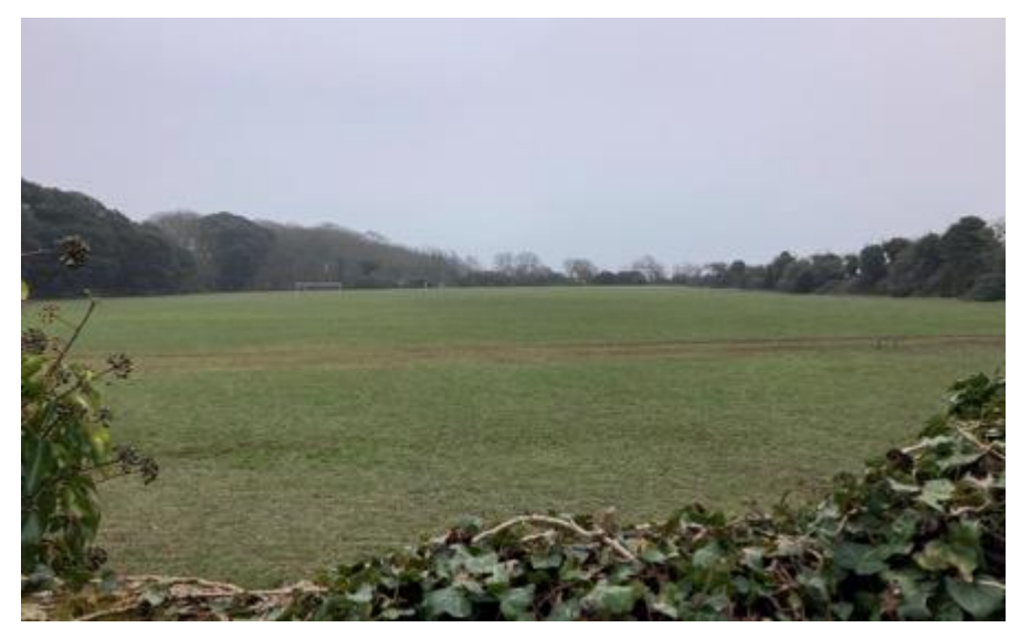
Figure 32: View from the raised promenade at Goring Hall to the south

Views from Goring Hall southwards are also of importance. These allow views to the open space beyond, which would have formerly allowed unrestricted views to the sea and are reflective of an important aspect of the buildings location. Views to the south are from the formal gardens with a raised walkway at the southern boundary of the halls grounds. The mature vegetation has restricted views to the sea, but there are likely to be views to the sea from the upper floors of the building.