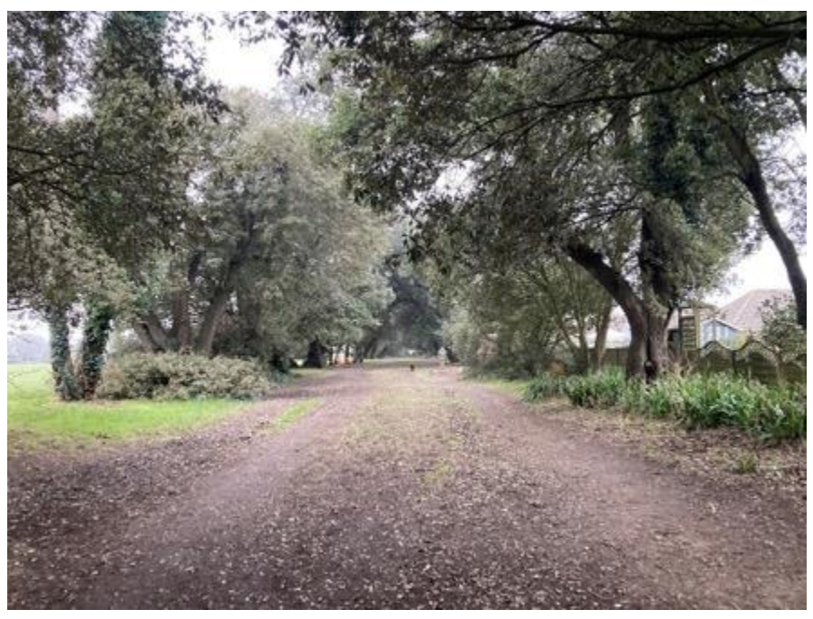
Figure 33: View westwards along Ilex Avenue