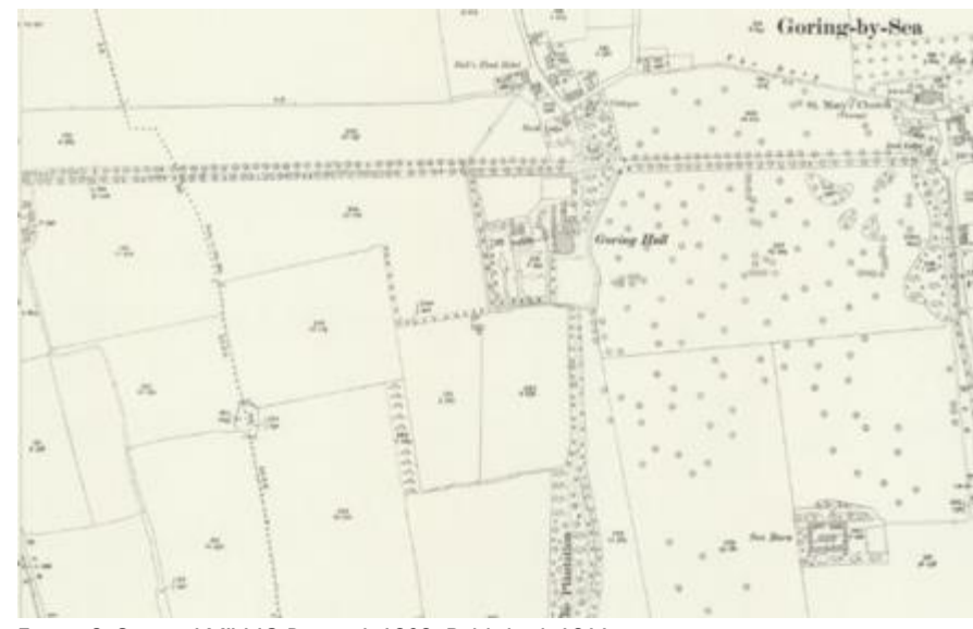
Figure 8: Sussex LXIV.13 Revised: 1909, Published: 1911