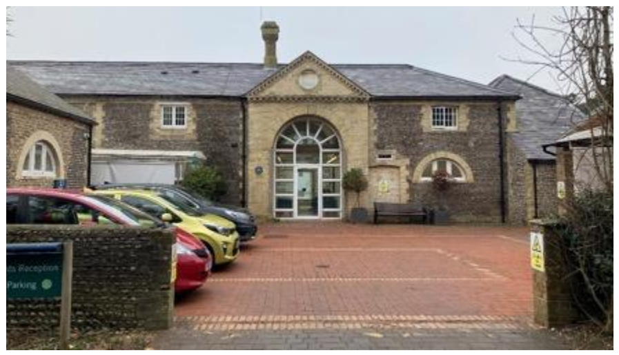
Figure 21: Former stable building at Goring Hall