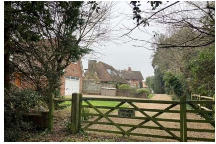
Figure 24: Modern housing within the conservation area