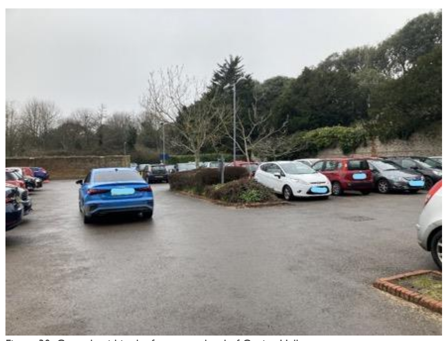
Figure 30: Carpark within the former orchard of Goring Hall