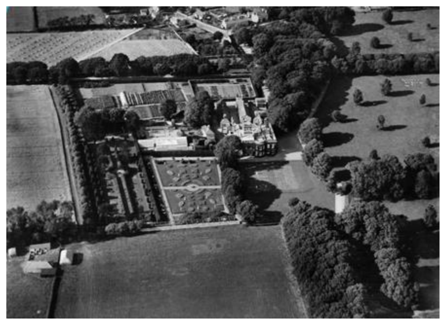
Figure 14: Goring Hall Estate, 1924

4.17 The Ilex Avenue running east to west through the conservation area is a key part of its character. This avenue was planted by the Lyon family to demarcate the historic approach to Goring Hall. It runs from Ferring in the west to St Mary's Church in the east. It is now a popular pedestrian area, with cyclists and walkers using the route. The lack of maintenance has resulted in a worn track with the trees making an enclosed dark space. A historic photograph from c.1930 shows the Avenue at this time with a well maintained central track, grass verges and gaps between the trees allowing natural light and views across the agricultural fields to the sea.