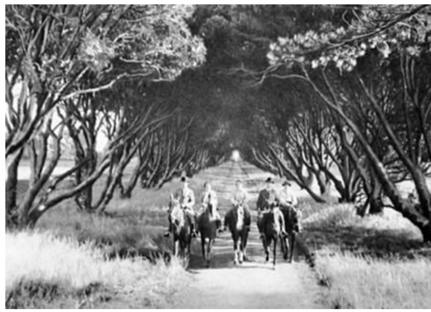
Figure 15: The Ilex Avenue, circa 1930

4.18 To the north of Goring Hall is North Lodge, (constructed c.1888 at the northern approach to the hall) and a small enclave of buildings in an informal arrangement (in contrast to the mid-20th century suburban development that surrounds it). These buildings form part of a group of buildings on the outskirts of the historic core of Goring village. Due to the mature hedgerows and tree planting, there is limited intervisibility between these buildings and Goring Hall.