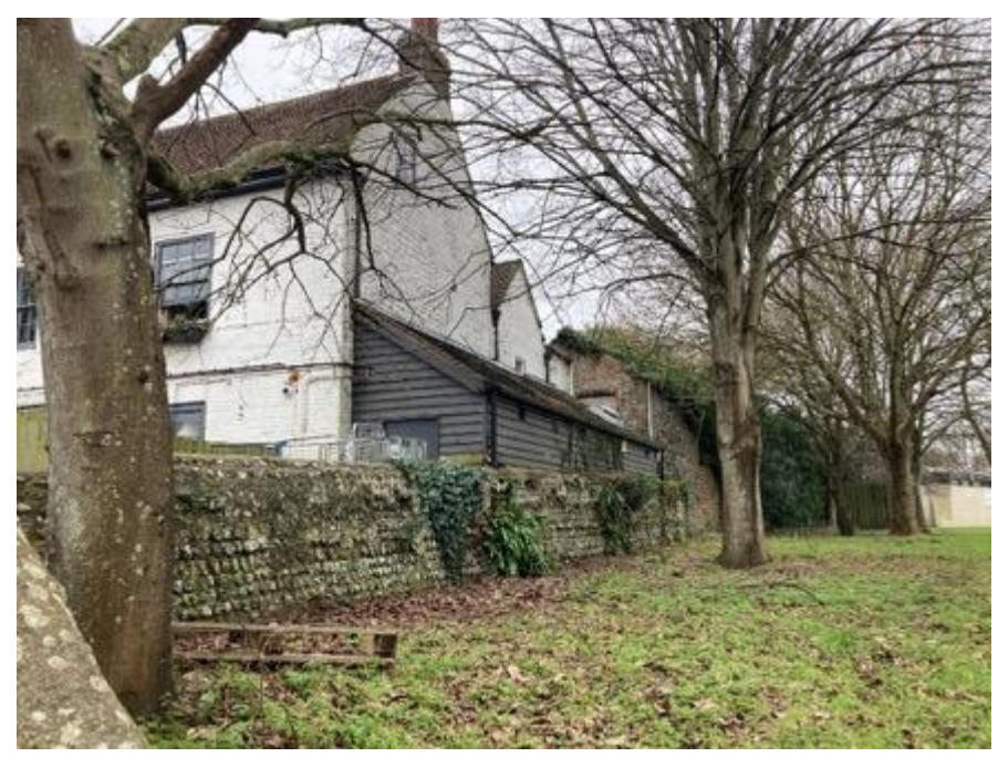
Figure 23: Examples of brick, flint and weatherboarding on and next to The Bull's Head.

which utilises random stone rubble for the external chimney breast and porch. Roofing materials are a mixture of clay and slate.