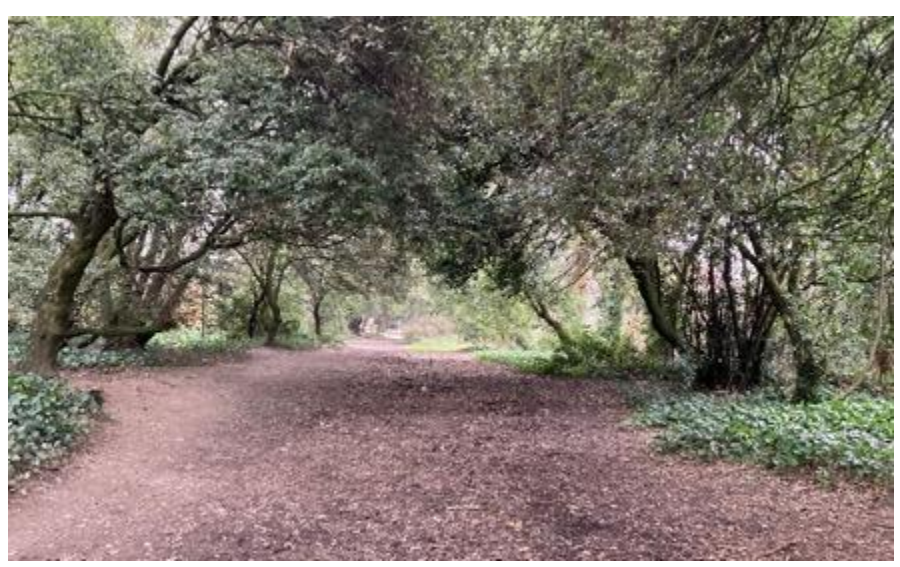
Figure 34: Views Eastwards along Ilex Avenue towards Sea Lane, Goring