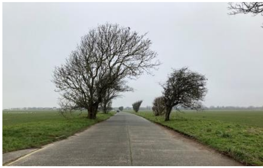
Figure 18: View facing westwards across the Goring-Ferring gap showing the roads laid out for the development of the Goring Hall estate.