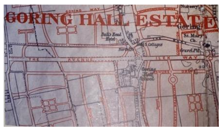
Figure 3: A portion of the estate to be laid out is indicated in red.