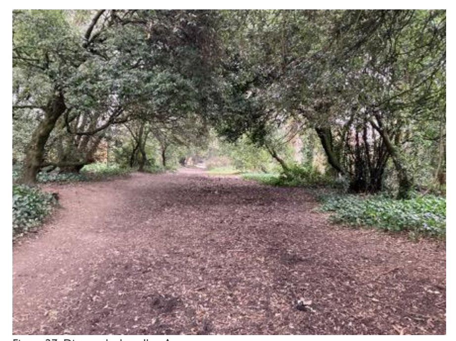
Figure 27: Dirt track along Ilex Avenue